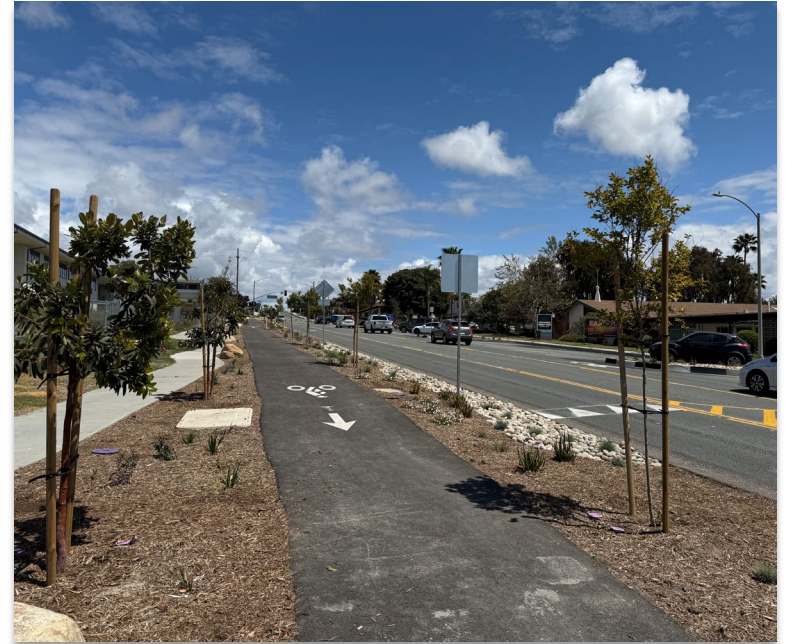
New westbound Separated Bike Lane - Santa Fe Drive, facing east