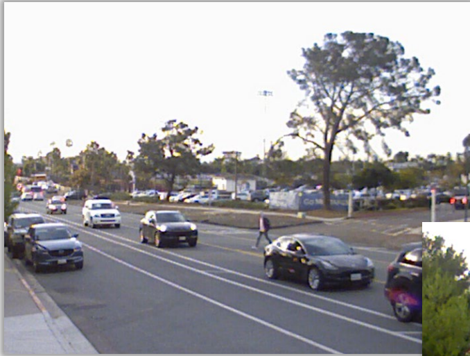
Lack of pedestrian facilities & traffic calming