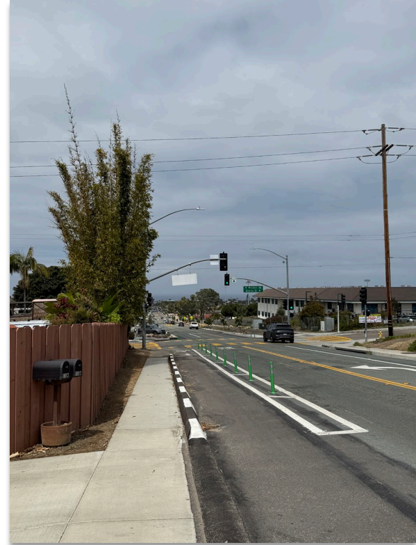
New Walkway & Bike Path - facing west towards Windsor Ave