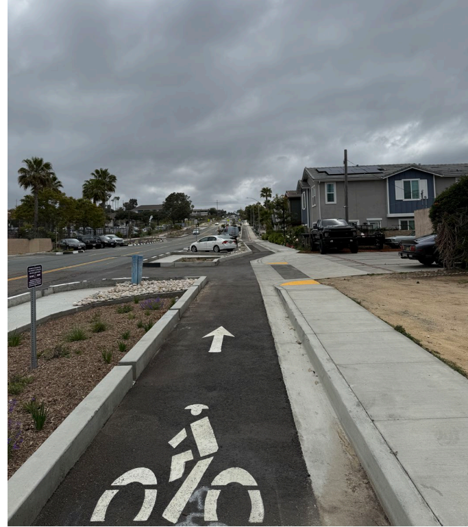
New eastbound Separated Bike Lane, Sidewalk & Bio-Basin - on south side of Santa Fe Drive, facing east