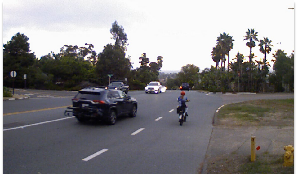
Bike Lanes with no buffer or protection