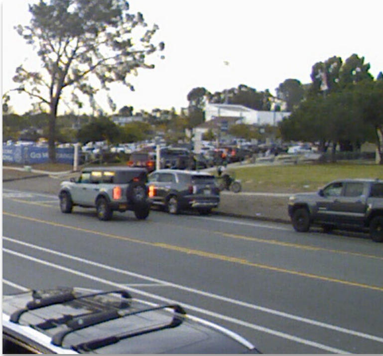
Parked cars blocking Bike Lane